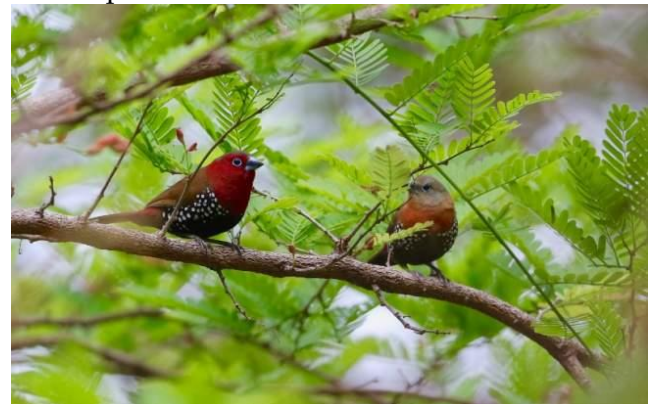
Red-throated Twinspots

is now present in numbers. Lizard Buzzard and Black-shouldered Kite are regulars there but a Black Sparrowhawk was new.