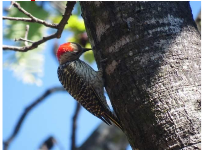
Chin-spot Batis and Cardinal Woodpecker by Ruth Baldwin-Paice & Sigrid Stone

The Southern Masked-weavers are plentiful in groups, making their "swizzling" sounds as they feed and drink in the garden and they love any palm tree or tall bamboo cluster. The sunbirds are quiet and seem to have moved away.